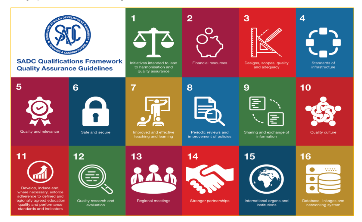
Figure 4: Infographic of SADCQF quality assurance guidelines

The SADC region is cognisant of the importance of robust and effective systems of quality assurance mechanisms in education and training provision to ensure trust and credibility of qualifications. The SADCQF is supported by regional quality assurance guidelines, which set principles and standards for both internal and external quality assurance systems and mechanisms. The figure below represents an infographic on the sixteen QA guidelines.