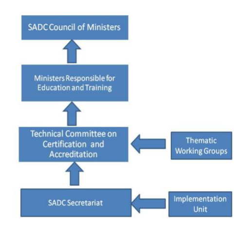
Figure 3: SADCQF Governance structure

SADC Council of Ministers: is a ministerial body consisting of ministers responsible for SADC affairs, from all member states, that oversees the development and functioning of the SADC Common Agenda. It approves all SADC policies, strategies and programmes (including cross-sectoral) for implementation and provides advice to the Heads of State/Summit on various issues of regional integration.