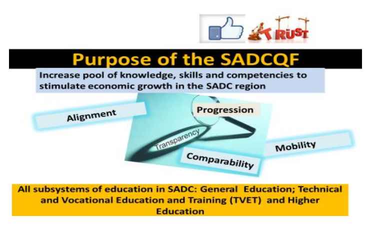
Figure 1: Purpose and Scope of SADCQF

Its scope is based on the principle of inclusiveness encompassing all forms, types, levels and categories of education and training. This includes out of school, formal, non-formal and informal learning; general education, TVET, higher education and various modes of learning such as face-to-face, distance and on-line.