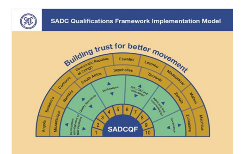
Figure 5 : Infographic of the SADCQF Qualifications Implementation Model