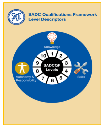
Figure 2: Infographic on the SADC Level Descriptor categories/ domains Source: SADC Secretariat 2017. SADCQF Communication Material

Technical Committee on Certification and Accreditation (TCCA) provides overall technical oversight, and advocates for and oversees the development and implementation of the SADCQF.